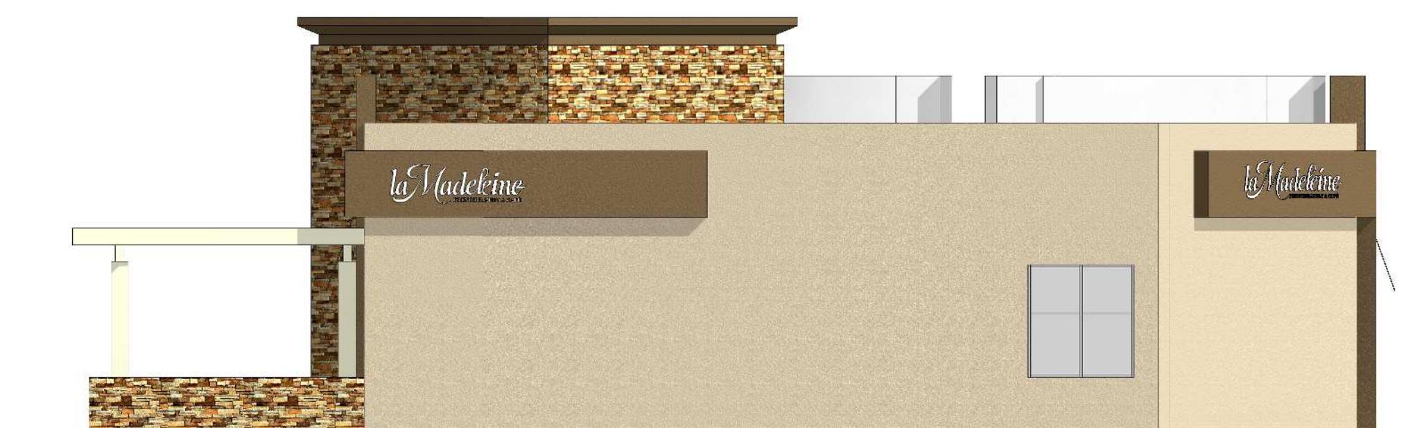
B5 WEST ELEVATION 1/8" = 1'-0" 0' 4' 8' 16'