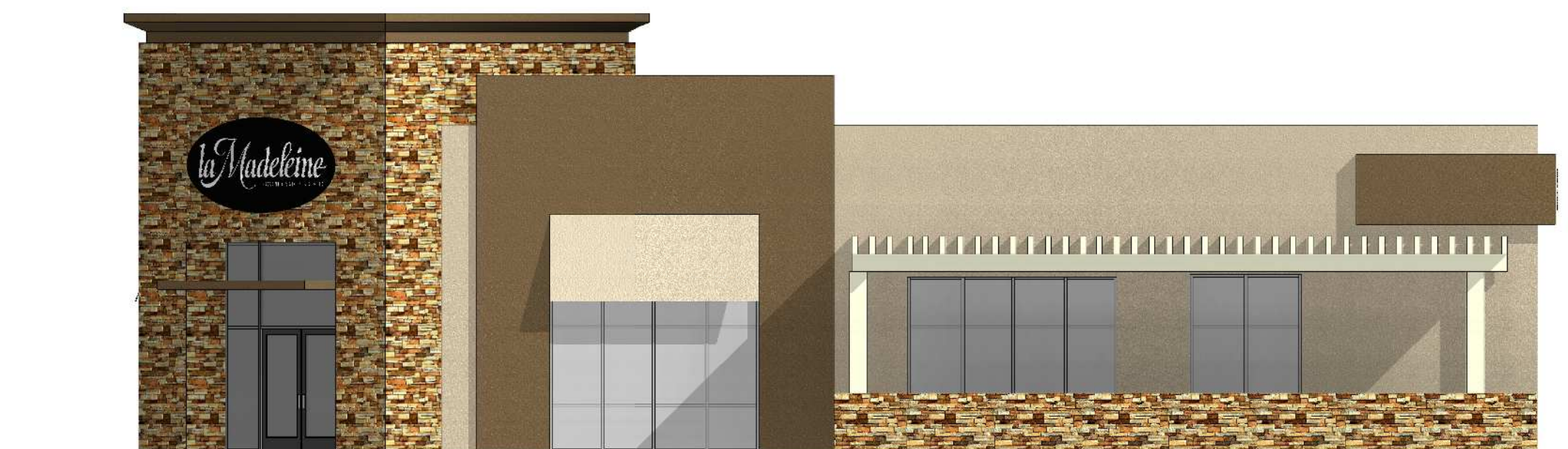
C5 NORTH ELEVATION 1/8" = 1'-0" 0' 4' 8' 16'