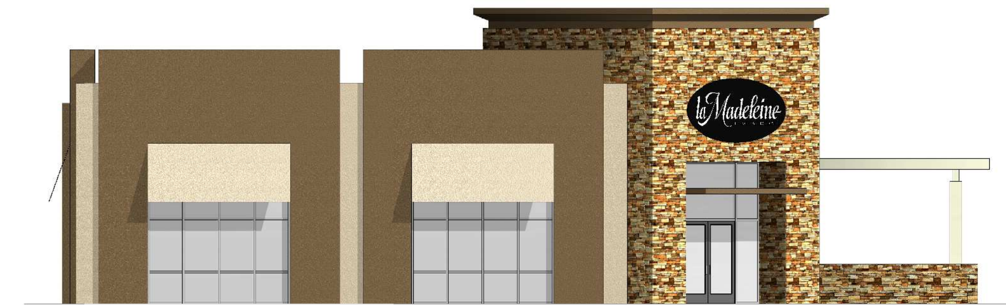
D5 EAST ELEVATION 1/8" = 1'-0" 0' 4' 8' 16'